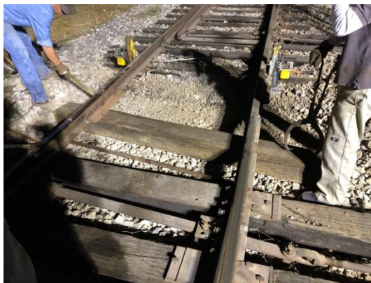
Volunteers maintaining SCRM Track

Additional contacts are listed on the Meet the Museum: Division and Area Contacts guide for more information.