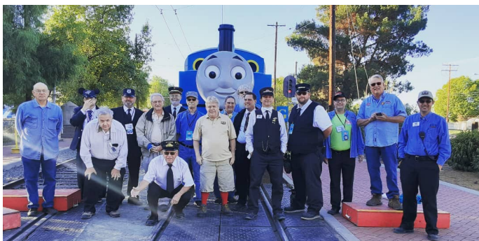
Day out with Thomas

Additional contacts are listed on the Meet the Museum: Division and Area Contacts guide for more information.