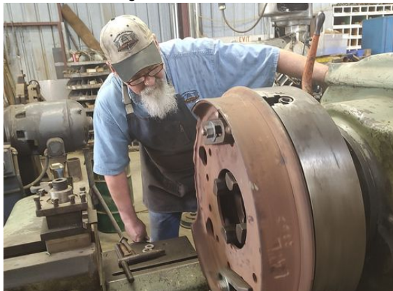
Volunteer maintaining trolley parts