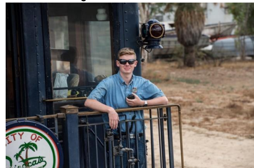
Action Photos of Operations Volunteers